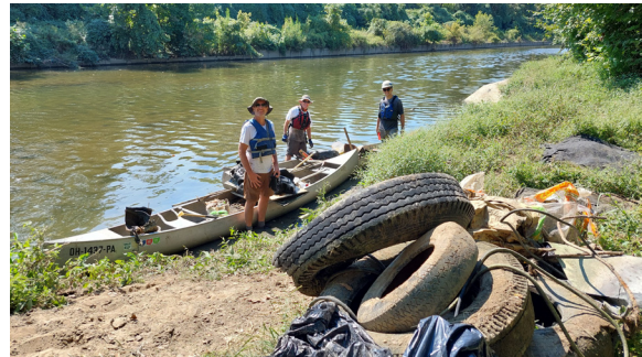
WorkPARTY in the Watershed-September 02, 10am-1pm