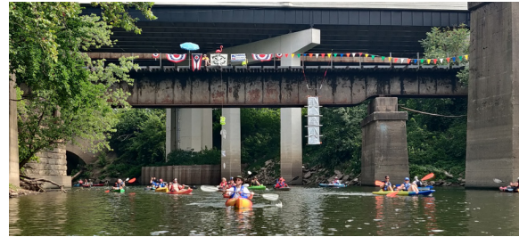
Urban Stream Adventure: August 26, 9am-1pm

Summer vacations are winding down but the upcoming events with Mill Creek Alliance are in full swing. Paddle with us at our next Urban Stream Adventure, restore habitats at our next WorkPARTY in the Watershed, and if you have volunteered with MCA in the past, be sure to RSVP for the Volunteer Appreciation Picnic!