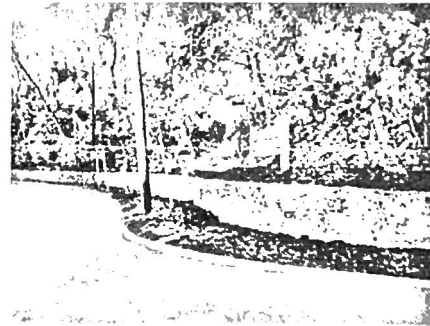
Fairview Wall After