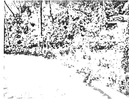
Fairview Wall Before

and actually show off the beautiful old wall underneath all the brush. Thank you to everyone who worked on this project!!!