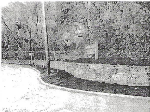
Fairview Wall After