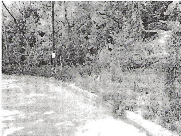
Fairview Wall Before

and actually show off the beautiful old wall underneath all the brush. Thank you to everyone who worked on this project!!!