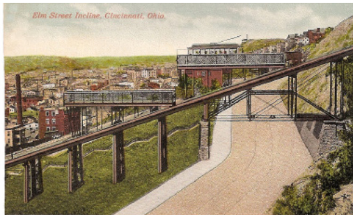
Postcard from a few years later showing a more permanent set of steps.

https://overtherhine.wordpress.com/2012/06/21/the-bellevue-incline-and-elm-street-steps/ and http://www.shorpy.com/node/8235