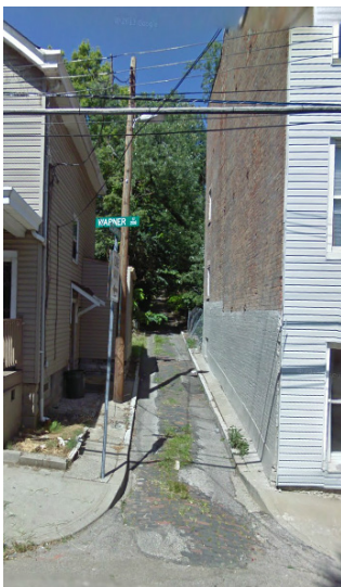
Schorr Alley from Warner St.