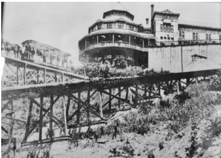
A horse-car departs the Bellevue House (1876-1926) on the Cincinnati-Clifton Incline Plane. The first electric streetcars appeared in 1889.