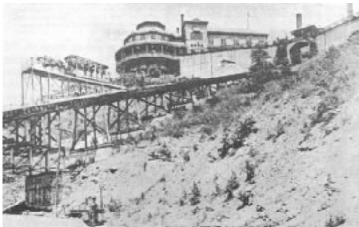
The Bellevue Incline, 1876-1926. The limestone support is still standing.

than just passengers, people could travel from the downtown to the suburbs without having to transfer here. This, as well as the growing temperance movement, caused the resort to close in 1895. Our history as a recreation destination did not begin with the University and the student housing changes that began in the 1960s!